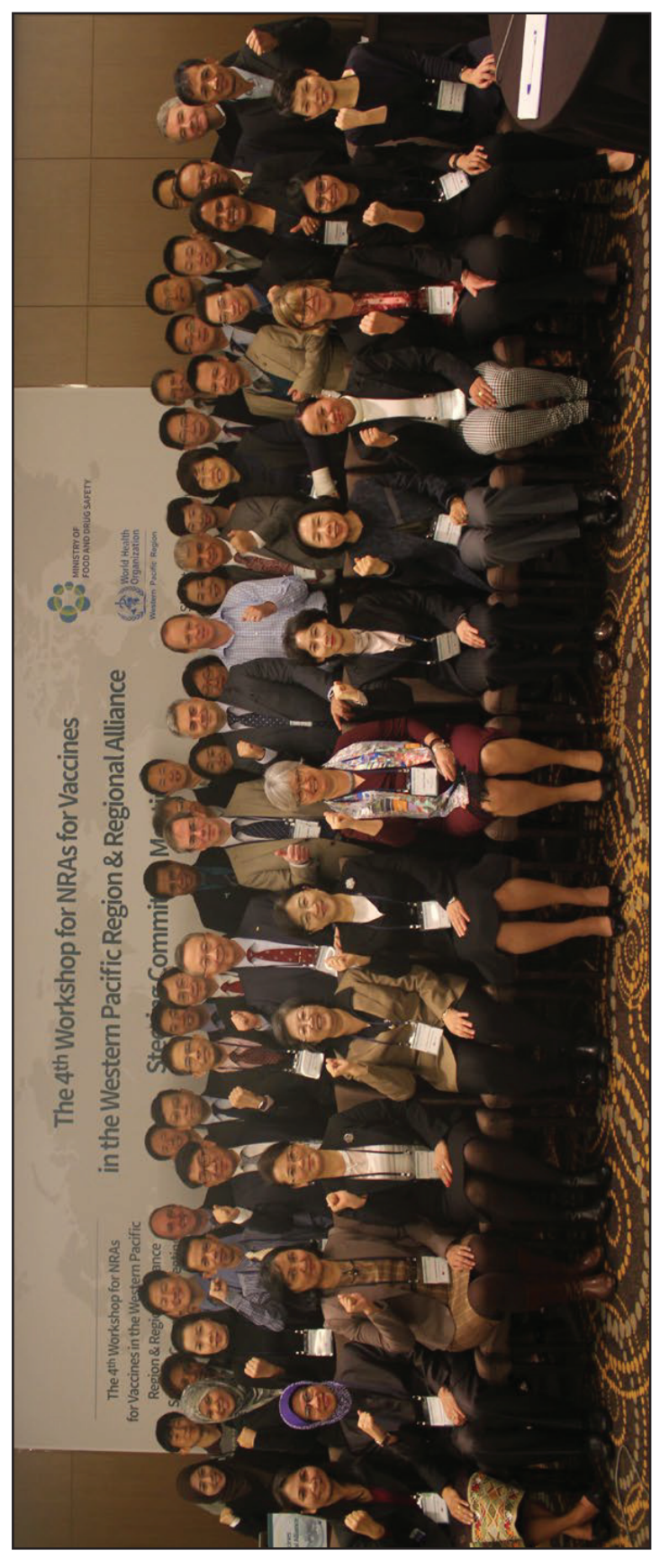
Fourth Workshop for National Regulatory Authorities for Vaccines in the Western Pacific Region Seoul, Republic of Korea 15–16 December 2015