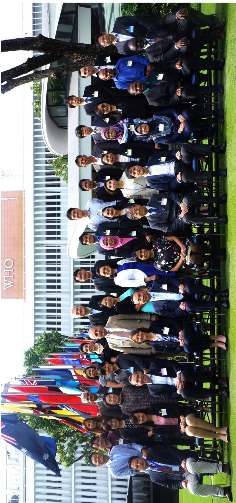
Sixth Workshop for National Regulatory Authorities for Vaccines and Medicines in the Western Pacific Region 29-31 August 2017 Manila, Philippines